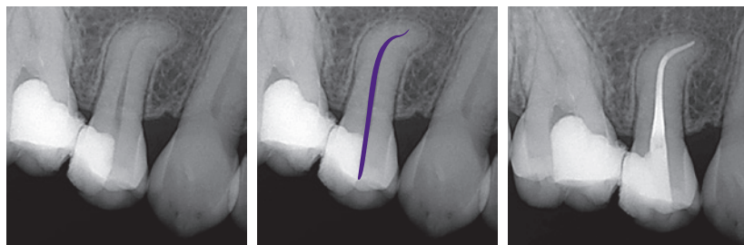
Pre-operation Diagnosis: pulpitis