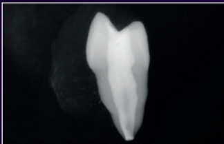
Radiograph showing the bucco-lingual aspect of the maxillary first premolar