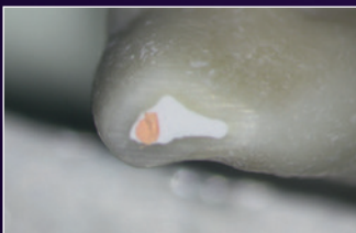
Cross-section 1 mm from the apex